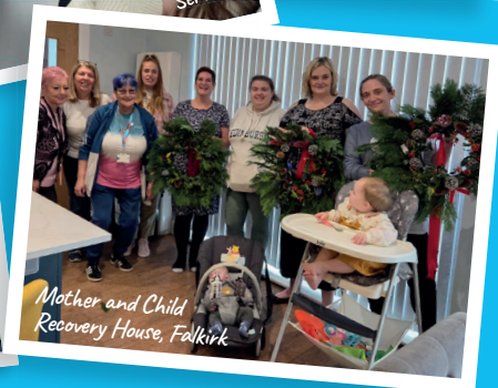
Mother and Child Recovery House, Falkirk